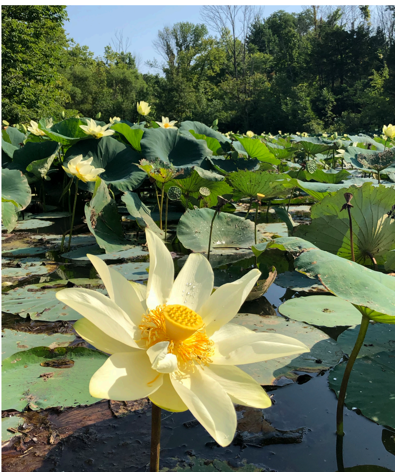
Nelumbo lutea American Lotus