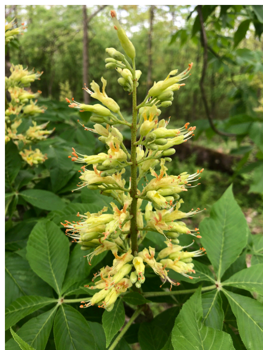
Aesculus glabra Ohio Buckeye

In specific geographic areas, native plants thrive on local soils with unique water, light, temperature, and growing conditions.