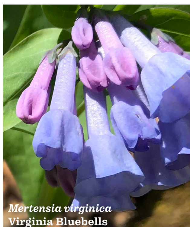
Mertensia virginica Virginia Bluebells