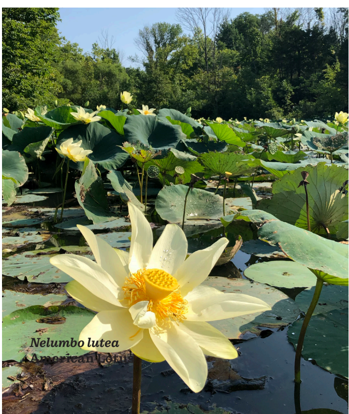
Nelumbo lutea American Lotus