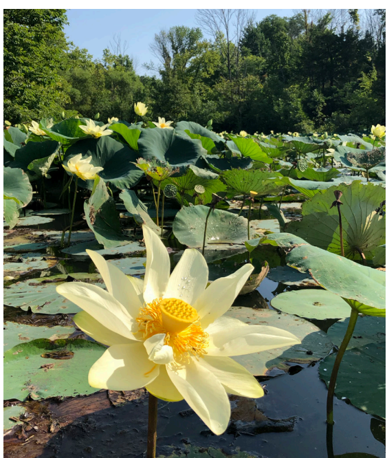
Nelumbo lutea American Lotus