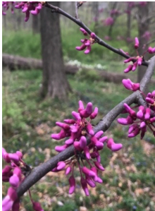
Eastern Redbud Cercis canadensis