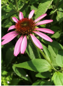
Purple Coneflower Echinacea purpurea