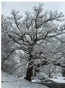
Bur Oak Quercus macrocarpa